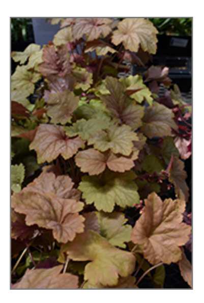
Big Top Caramel Apple Coral Bells foliage

This is a relatively low maintenance plant, and should be cut back in late fall in preparation for winter. It is a good choice for attracting hummingbirds to your yard. It has no significant negative characteristics.