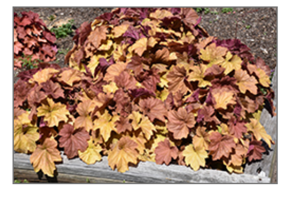
Big Top Caramel Apple Coral Bells

Big Top Caramel Apple Coral Bells is a dense herbaceous evergreen perennial with tall flower stalks held atop a low mound of foliage. Its relatively fine texture sets it apart from other garden plants with less refined foliage.