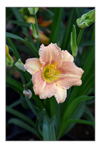
EveryDaylily Rose Daylily flowers

This reblooming, dwarf daylily has charming rosy-pink trumpets with red eyezones and bright green throats; pretty ruffled blooms; sturdy, strong, easy to care for, great grassy texture and form; great for containers, beds, and borders