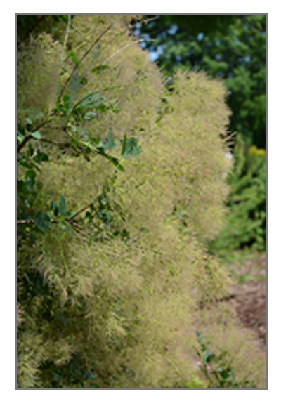
Young Lady Smokebush flowers

This shrub will require occasional maintenance and upkeep, and is best pruned in late winter once the threat of extreme cold has passed. Deer don't particularly care for this plant and will usually leave it alone in favor of tastier treats. It has no significant negative characteristics.