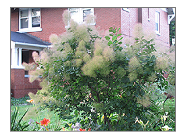
Young Lady Smokebush in bloom

Young Lady Smokebush is recommended for the following landscape applications;