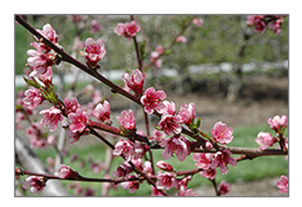
Reliance Peach flowers