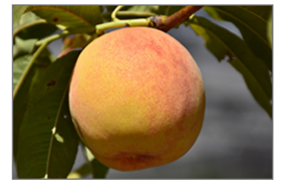
Reliance Peach fruit

Considered by many to be the hardiest peach variety, this ornamental tree produces showy pink flowers in spring, and juicy, red blushed freestone peaches in summer; susceptible to late spring freezes and disease, needs full sun and well-drained soil