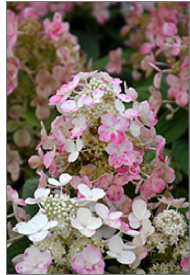
Torch Hydrangea flowers