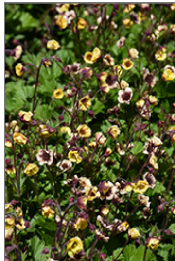
Tempo Yellow Avens flowers

Tempo Yellow Avens is recommended for the following landscape applications;