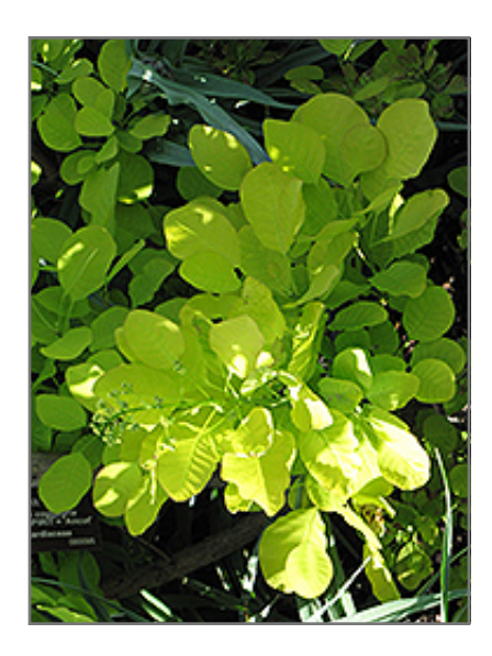
Golden Spirit Smokebush foliage