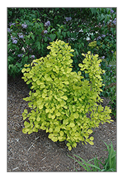
Golden Spirit Smokebush

Golden Spirit Smokebush is recommended for the following landscape applications;