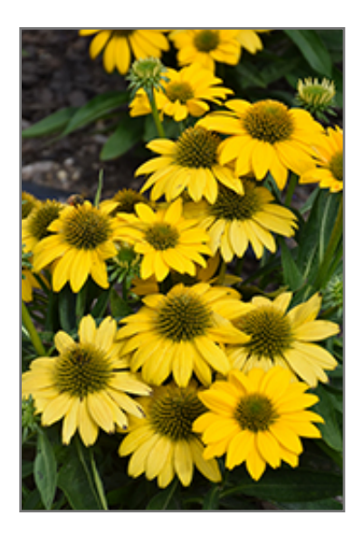
Sombrero Poco Yellow Coneflower flowers