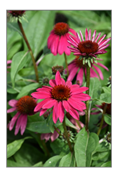
Sombrero Poco Hot Pink Coneflower flowers

A remarkable variety with eye catching color; strong, compact bushy habit that is ideal for sunny borders and mixed containers; large and fragrant flowers have striking, non-fading hot pink petals, surrounding a copper cone; deadhead spent blooms