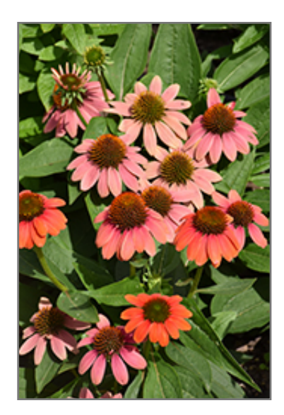
Sombrero Poco Hot Coral Coneflower flowers

A remarkable variety with eye catching color; strong, compact bushy habit that is ideal for sunny borders and mixed containers; large and fragrant flowers have striking coral petals with orange tips, surrounding a copper cone; deadhead spent blooms