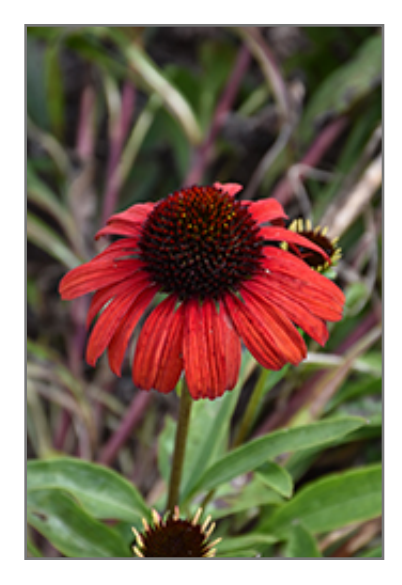
Butterfly Postman Coneflower flowers