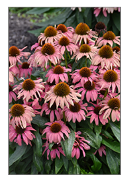
Playful Meadow Mama Coneflower flowers

A beautiful and charming variety ideal for sunny borders, beds or used in cut flower displays; raspberry-pink petals tipped with white encircling deep red cones rise above olive green foliage; strong stems with an upright bushy habit