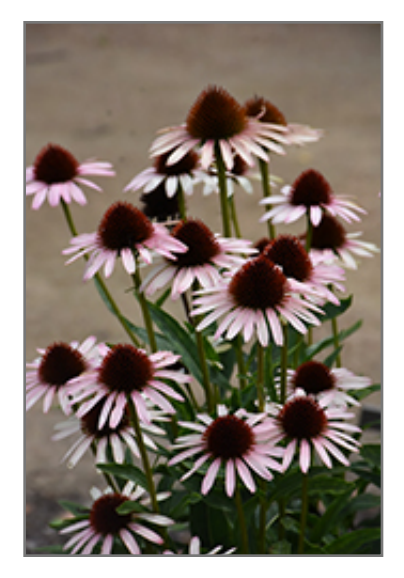
Blushing Meadow Mama Coneflower flowers