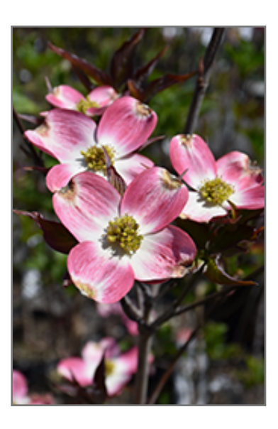
Erica's Appalachian Sunrise Flowering Dogwood flowers

Erica's Appalachian Sunrise Flowering Dogwood features showy bracted pink flowers with coral-pink overtones and white centers held atop the branches in mid spring. It has dark green deciduous foliage. The pointy leaves turn an outstanding dark red in the fall. It produces red berries from late summer to mid fall. The warty gray bark adds an interesting dimension to the landscape.