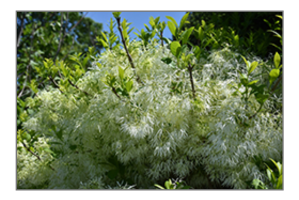
White Knight Fringetree flowers