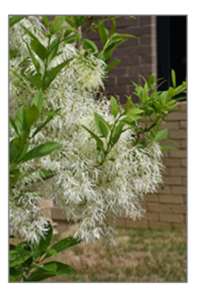
White Knight Fringetree flowers

White Knight Fringetree is recommended for the following landscape applications;