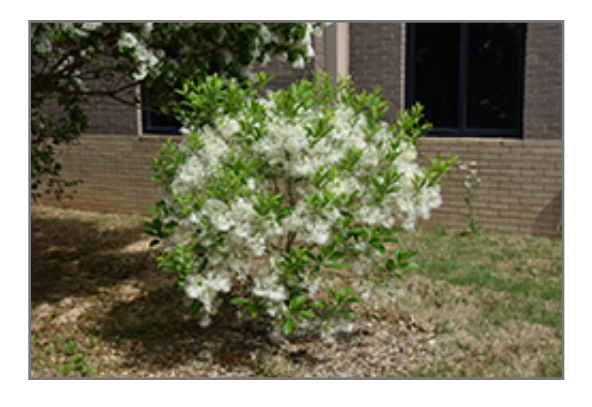
White Knight Fringetree in bloom

White Knight Fringetree will grow to be about 15 feet tall at maturity, with a spread of 10 feet. It has a low canopy with a typical clearance of 1 foot from the ground, and is suitable for planting under power lines. It grows at a slow rate, and under ideal conditions can be expected to live for 70 years or more.