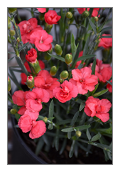
Rosebud Dianthus flowers

Vigorous and free flowering, this compact mounded selection features lovely fragrant, frilly rose-pink flowers over blue-green foliage; easy to grow, tolerating some heat and humidity, perfect for rock gardens, borders, beds or containers