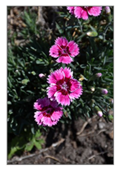
EverBloom Plum Glory Pinks flowers

Plant Height: 6 inches Flower Height: 8 inches Spread: 24 inches Spacing: 18 inches Sunlight: O Hardiness Zone: 3b Other Names: Border Pinks, Cheddar Pinks Group/Class: EverBloom Series