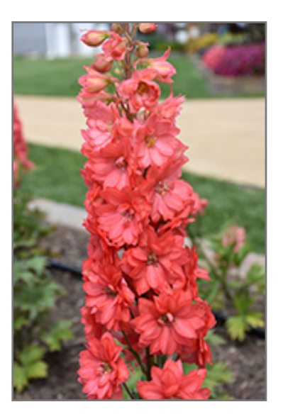
Red Lark Larkspur flowers