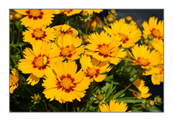
Solanna Bright Touch Tickseed flowers

Solanna Bright Touch Tickseed is an herbaceous perennial with a mounded form. Its relatively fine texture sets it apart from other garden plants with less refined foliage.