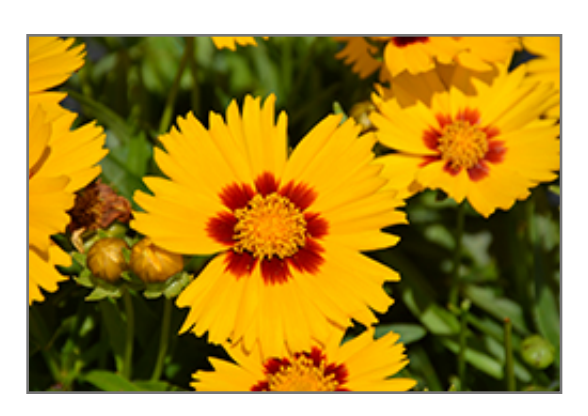
Solanna Bright Touch Tickseed flowers

This is a relatively low maintenance plant, and is best cleaned up in early spring before it resumes active growth for the season. It is a good choice for attracting butterflies to your yard, but is not particularly attractive to deer who tend to leave it alone in favor of tastier treats. It has no significant negative characteristics.