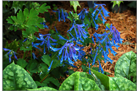
Blue Corydalis flowers