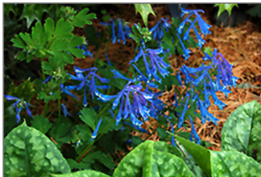
Blue Corydalis flowers