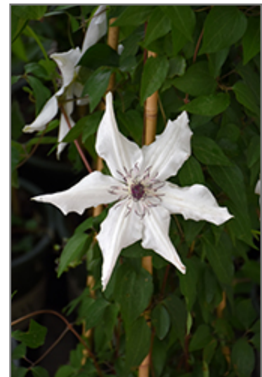
Vancouver Fragrant Star Clematis flowers