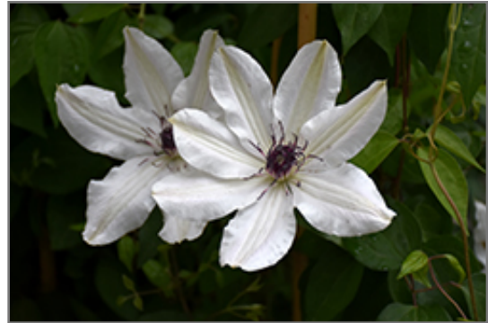
Vancouver Fragrant Star Clematis flowers

This is a relatively low maintenance woody vine. It is a Type 2 clematis, which means it will bloom primarily on old wood of the previous season, with a second flush later in summer. Dead and weak vines should be removed in late winter, and remaining vines should be trimmed back to the first buds that are seen to remove dead stems. It is a good choice for attracting bees and hummingbirds to your yard. It has no significant negative characteristics.