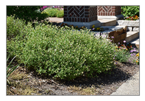
New Jersey Tea in bloom