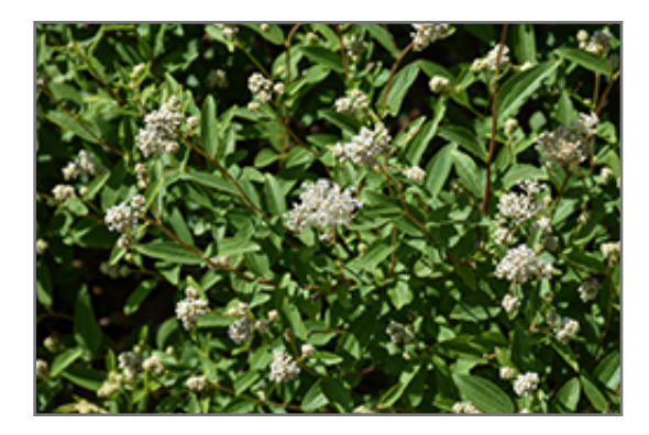
New Jersey Tea flowers

New Jersey Tea is a dense multi-stemmed deciduous shrub with a more or less rounded form. Its average texture blends into the landscape, but can be balanced by one or two finer or coarser trees or shrubs for an effective composition.