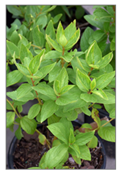
New Jersey Tea foliage

This shrub does best in full sun to partial shade. It prefers dry to average moisture levels with very well-drained soil, and will often die in standing water. It is considered to be drought-tolerant, and thus makes an ideal choice for a low-water garden or xeriscape application. This plant is capable of fixing its own nitrogen, which means that it is effectively self-fertilizing. As a result it should not require supplemental fertilizing, and if you do fertilize it, be sure to only use a low-nitrogen fertilizer to promote root growth. It is not particular as to soil pH, but grows best in sandy soils, and is able to handle environmental salt. It is highly tolerant of urban pollution and will even thrive in inner city environments. This species is native to parts of North America.