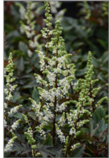
Happy Spirit Astilbe flowers

Happy Spirit Astilbe is recommended for the following landscape applications;