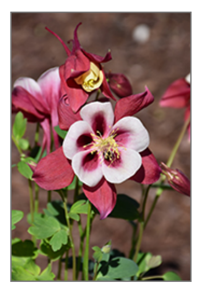
Earlybird Red and White Columbine flowers

Showy, red nodding flowers with white centers on slender stems with long, graceful spurs; makes for long lasting cut flowers; controlled habit with short stems on well mounded plants; good for naturalizing partially shaded areas