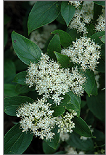
Snow Lace Dogwood flowers