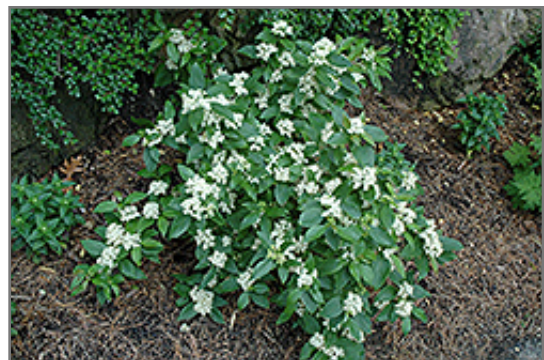
Snow Lace Dogwood in bloom