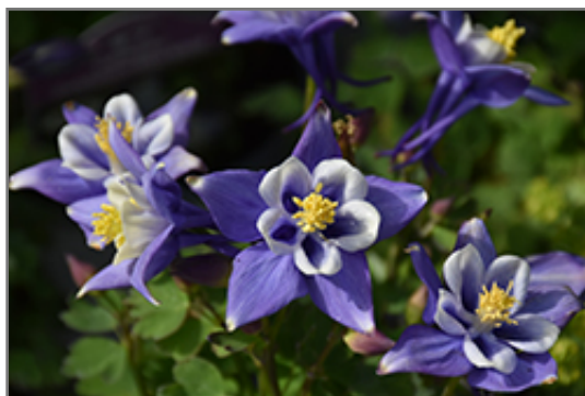
Earlybird Blue and White Columbine flowers