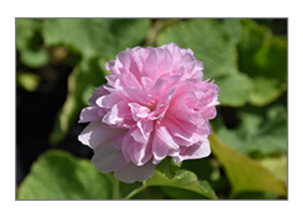
Peaches n' Dreams Hollyhock flowers

Bold, ruffled, double peach colored flowers appear on towering spikes from mid to late summer; a wonderful addition to cottage gardens or along borders or fences; makes excellent cut flower displays; easy to grow and drought tolerant once established