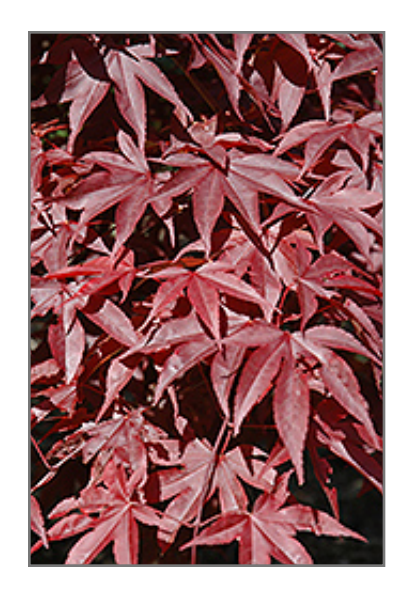
Dragon Tears Japanese Maple foliage