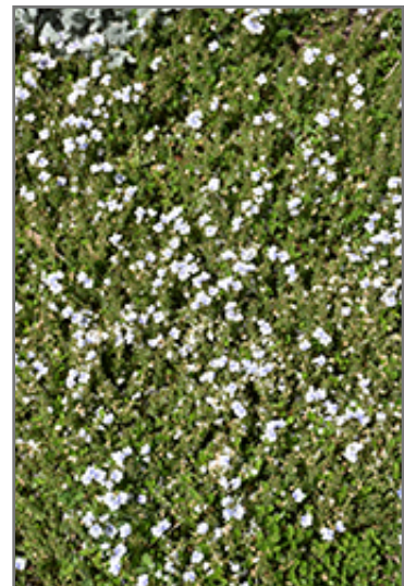
Snowmass Blue-Eyed Veronica in bloom