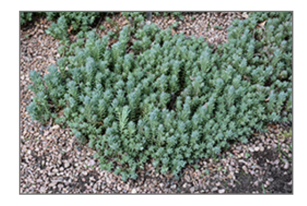
Turquoise Tails Blue Sedum