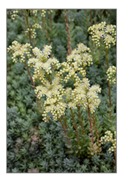
Turquoise Tails Blue Sedum flowers