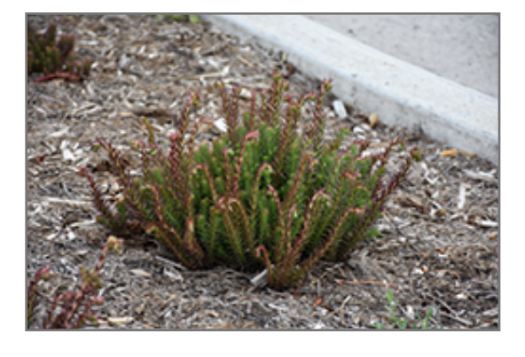
Winter Fire Sedum

Winter Fire Sedum is a dense herbaceous evergreen perennial with a ground-hugging habit of growth. It brings an extremely fine and delicate texture to the garden composition and should be used to full effect.