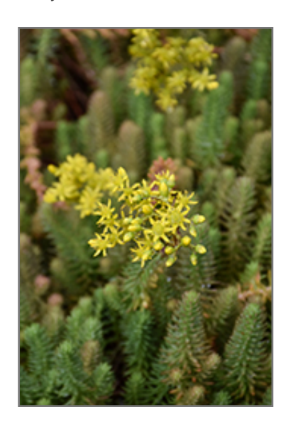
Winter Fire Sedum flowers

This plant will require occasional maintenance and upkeep, and is best cleaned up in early spring before it resumes active growth for the season. Deer don't particularly care for this plant and will usually leave it alone in favor of tastier treats. Gardeners should be aware of the following characteristic(s) that may warrant special consideration;