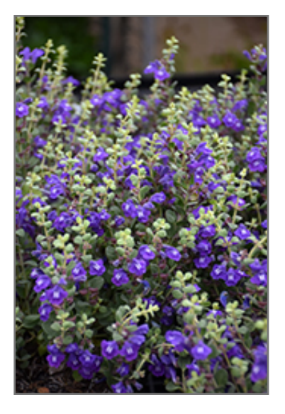
Smoky Hills Skullcap flowers