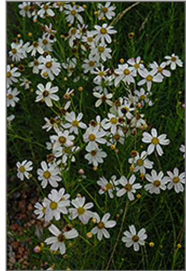
White Alpine Tickseed flowers