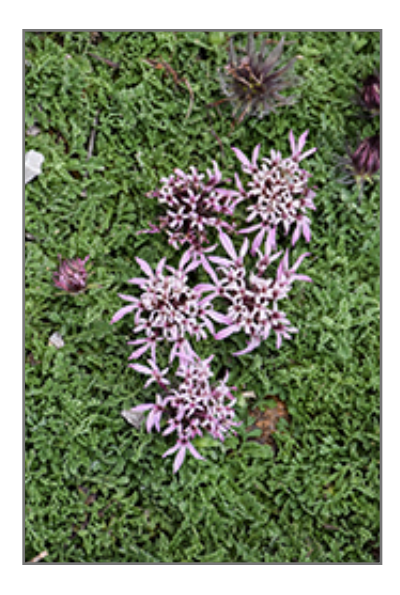
Carpeting Pincushion Flower flowers