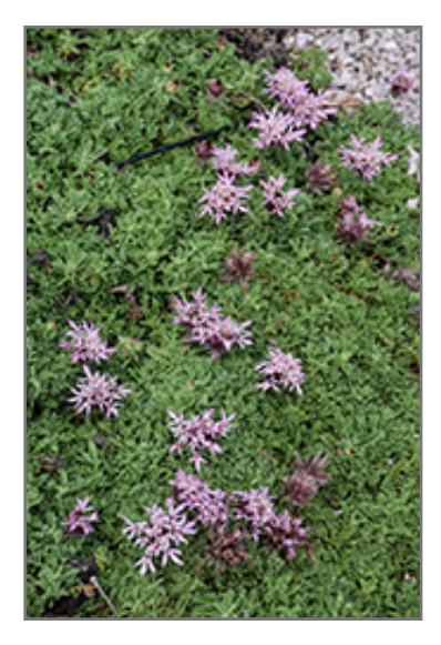
Carpeting Pincushion Flower in bloom

Carpeting Pincushion Flower is a dense herbaceous evergreen perennial with a ground-hugging habit of growth. It brings an extremely fine and delicate texture to the garden composition and should be used to full effect.