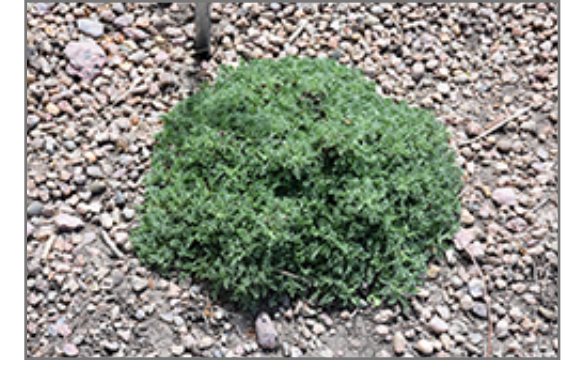
Carpeting Pincushion Flower

Carpeting Pincushion Flower will grow to be only 2 inches tall at maturity extending to 3 inches tall with the flowers, with a spread of 20 inches. When grown in masses or used as a bedding plant, individual plants should be spaced approximately 16 inches apart. Its foliage tends to remain low and dense right to the ground. It grows at a medium rate, and under ideal conditions can be expected to live for approximately 10 years. As an evegreen perennial, this plant will typically keep its form and foliage year-round.