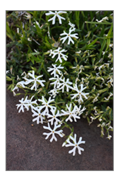
Snowmass Phlox flowers

Vigorous mats of dark evergreen foliage that is covered with white snowflake-like flowers in spring; grows well in rocky ravine areas or well drained, sandy soils; great for beds, border fronts or edging; moderate water requirement