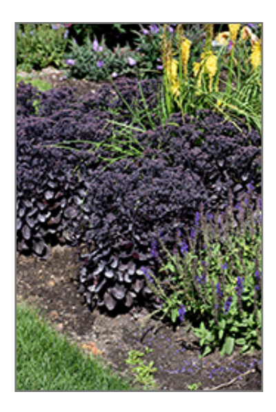
Rock 'N Grow Midnight Velvet Stonecrop in bloom