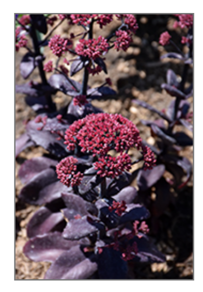
Rock 'N Grow Midnight Velvet Stonecrop flowers

Rock 'N Grow Midnight Velvet Stonecrop is a dense herbaceous perennial with an upright spreading habit of growth. Its relatively coarse texture can be used to stand it apart from other garden plants with finer foliage.