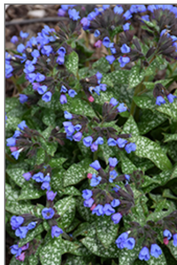
Pink-A-Blue Lungwort flowers

Pink-A-Blue Lungwort is recommended for the following landscape applications;