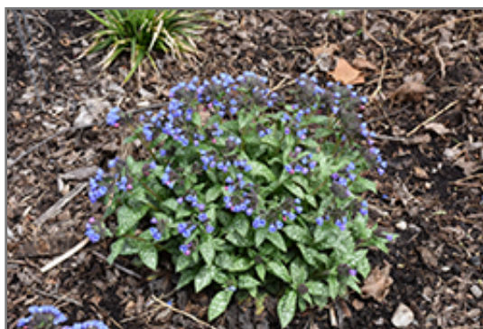
Pink-A-Blue Lungwort in bloom