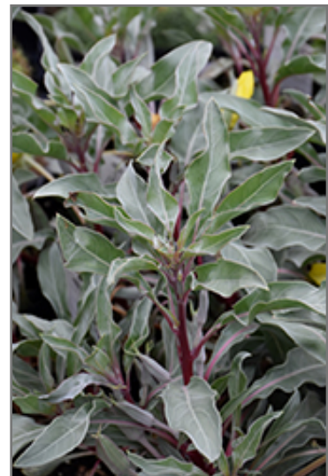
Silver Blade Evening Primrose foliage