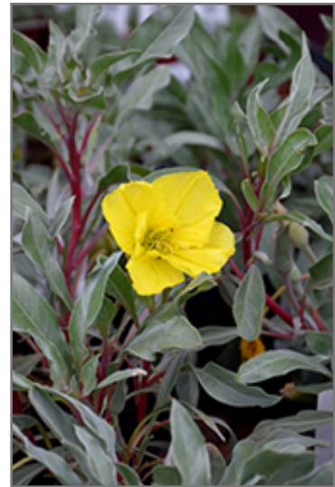
Silver Blade Evening Primrose flowers