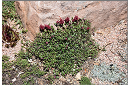
Marian Sampson Scarlet Monardella in bloom

Marian Sampson Scarlet Monardella is a fine choice for the garden, but it is also a good selection for planting in outdoor pots and containers. Because of its spreading habit of growth, it is ideally suited for use as a 'spiller' in the 'spiller-thriller-filler' container combination; plant it near the edges where it can spill gracefully over the pot. Note that when growing plants in outdoor containers and baskets, they may require more frequent waterings than they would in the yard or garden. Be aware that in our climate, most plants cannot be expected to survive the winter if left in containers outdoors, and this plant is no exception. Contact our experts for more information on how to protect it over the winter months.