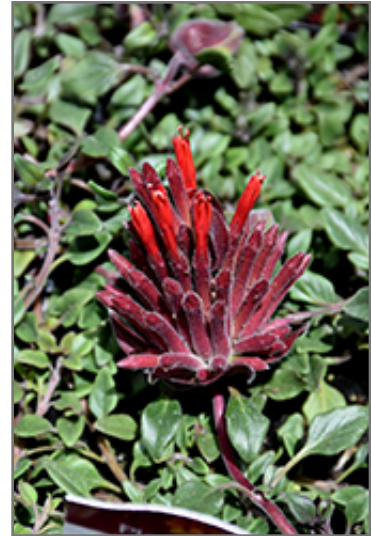
Marian Sampson Scarlet Monardella flowers

This is a relatively low maintenance plant, and should not require much pruning, except when necessary, such as to remove dieback. It is a good choice for attracting hummingbirds to your yard. It has no significant negative characteristics.