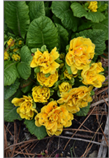
Prima Belarina Mandarin Primrose flowers

Prima Belarina Mandarin Primrose is recommended for the following landscape applications;