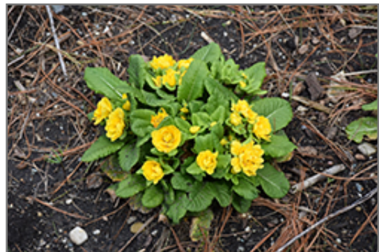
Prima Belarina Mandarin Primrose in bloom