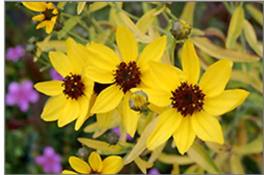
Lightning Flash Tickseed flowers

Lightning Flash Tickseed is recommended for the following landscape applications;