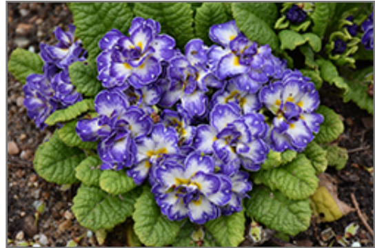
BELARINA Blue Ripples Primrose in bloom