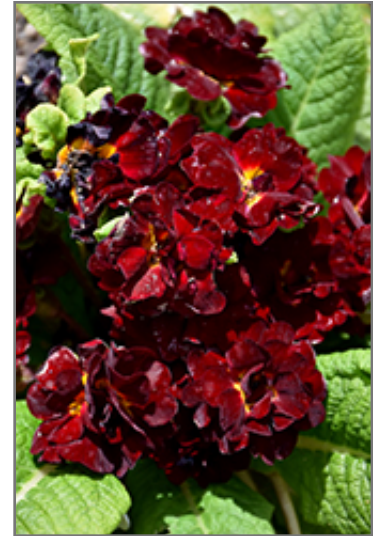
BELARINA Valentine Primrose flowers

BELARINA Valentine Primrose is recommended for the following landscape applications;