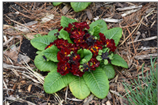
BELARINA Valentine Primrose in bloom