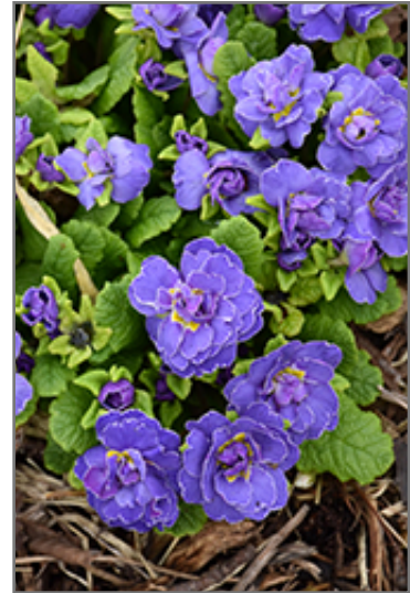
BELARINA Amethyst Ice Primrose flowers

BELARINA Amethyst Ice Primrose is recommended for the following landscape applications;