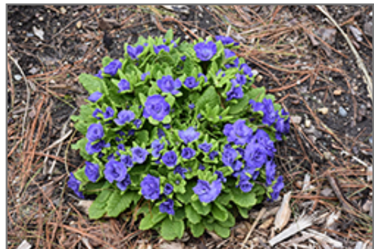
BELARINA Amethyst Ice Primrose in bloom