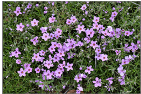
Eye Shadow Creeping Phlox flowers

Eye Shadow Creeping Phlox is recommended for the following landscape applications;