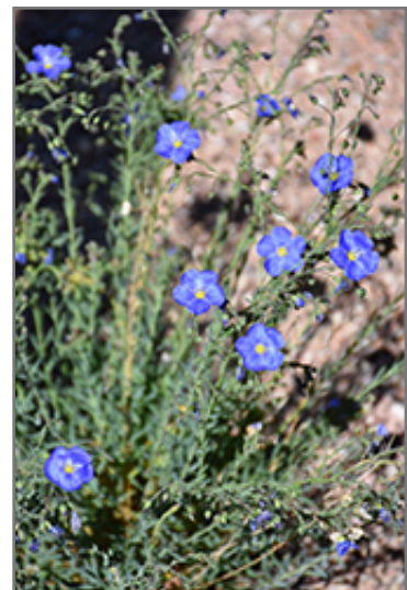
Wild Blue Flax flowers