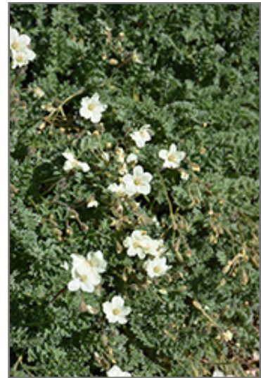
Yellow Heron's Bill flowers

Yellow Heron's Bill is recommended for the following landscape applications;