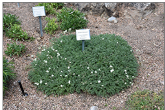
Yellow Heron's Bill in bloom