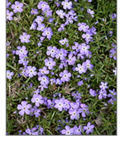
Rocky Road Periwinkle Phlox flowers