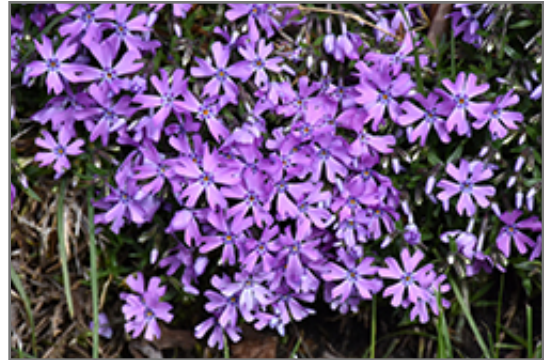
Bedazzled Orchid Phlox flowers