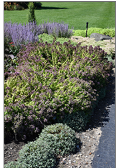
Drops of Jupiter Oregano in bloom